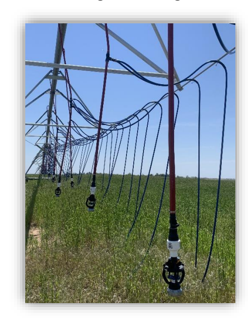
Figure 2. Precision mobile drip irrigation design by Netafim installed in a farmer's field in Southcentral Kansas.

One of the biggest challenges in this project was working with farmers to gather the data from the field. There were instances when our desired set-up was altered because of changes in a farmer's operation. At one time, due to scheduling and weather conditions, the team was racing against a silage chopper to collect samples for the treatment.