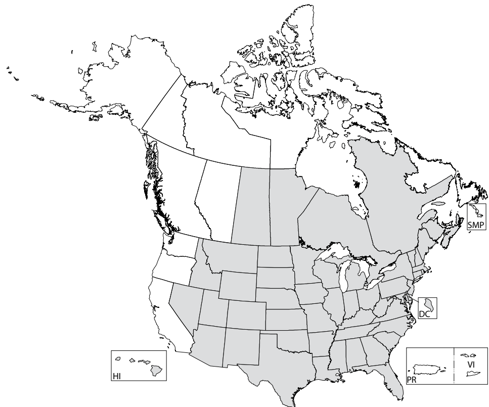
Figure 1. Switchgrass current distribution map.